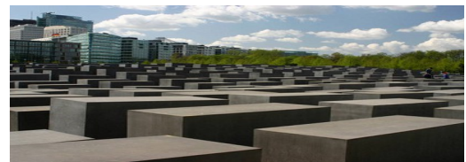
Holocaust Memorial to the murdered Jews of Europe