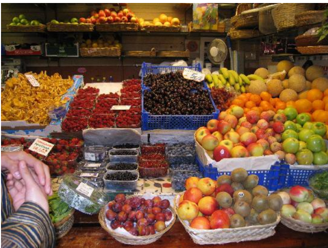
Market Square fresh fruit & vegetables