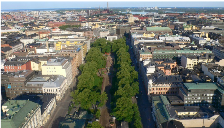
Esplanade aerial view