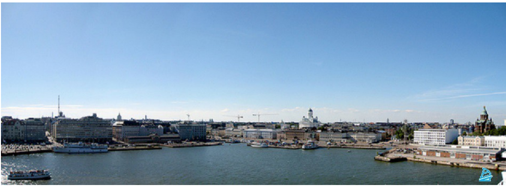
Harbor and Market Square area