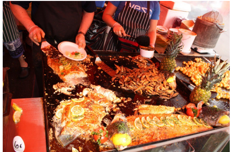
Market Square fresh seafood